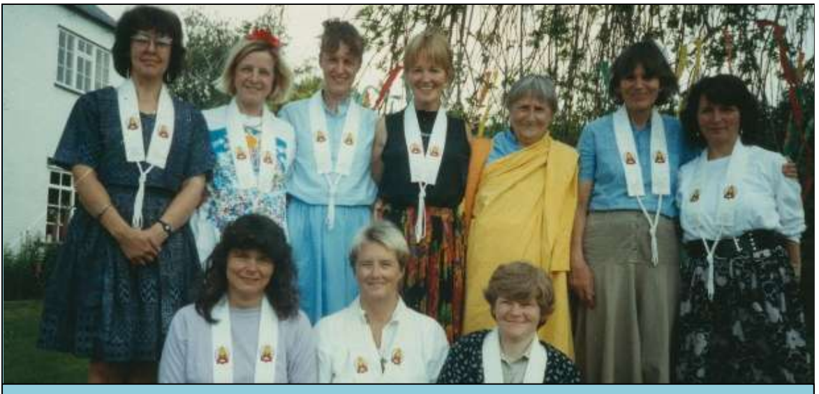
Taraloka community in its early days