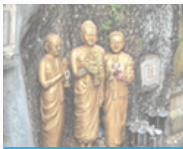
my sangha (15)