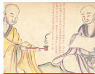
projects | groups