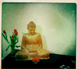
our team & centre!

Hi, I'm Dhammarati, Chair of the Seattle Buddhist Center. This is an example of a blurb post : it might need its own content type, I suppose and be length-limited to fit. Picture? The home page for Projects would feature just this and should be posted by the Chair. It's simple and uncomplicated. Users would have three main ways to connect - by following on our site (so you get posts from the project in your 'my sangha' feed), via the project's own site and by viewing the project's own program. I'd like to see the latter published as a pdf, preferably embedded from Issuu so it opens in full-screen immediately. Later programs might become interactive content types (calendar-like, bookable events, etc.).