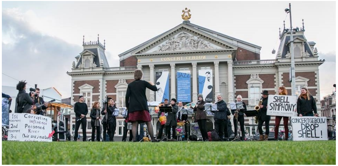
Music action (Oct 5th, 2017) ' Drop Shell sponsorship ' Royal Concertgebouw, Amsterdam.

We can shift public support away from the fossil fuel industry by pressuring our public institutions to break the sponsorship ties they have with many fossil fuel companies.